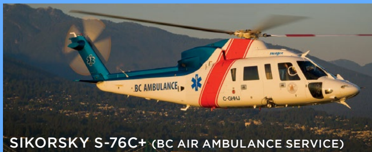
SIKORSKY S-76C+ (BC AIR AMBULANCE SERVICE)