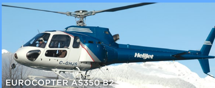
EUROCOPTER AS350 B2