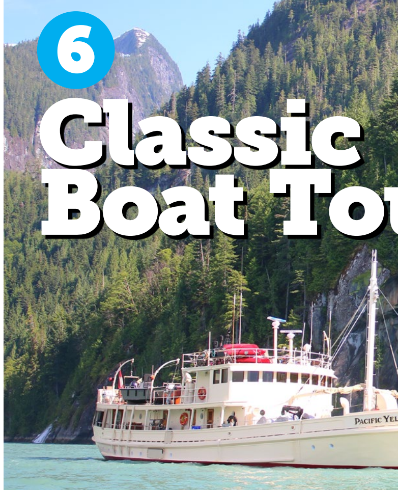
Once a U.S. military vessel, the Pacific Yellowfin is now an exclusive private charter yacht. Bottom right: The Passing Cloud is known for her elegant design.

and the rare white Spirit Bear found nowhere else. Glacier-scoured fiords, spectacular estuaries, ancient forests, outer coast beaches and temperate rainforests offer once-in-a-lifetime experiences.